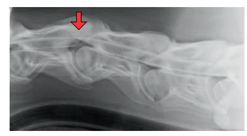
Figure 2. Myelography showing compression at C4-C5 in a horse with CVSM.

To summarize, CVSM can occur in young horses as part of developmental orthopedic disease and in older horses with neck arthritis. Horses with CVSM typically show signs of incoordination that affect all four limbs, and diagnostic testing often includes cervical radiographs, CSF analysis (spinal tap) and myelography. Conservative treatment is often unrewarding, although cervical steroid injections can improve symptoms in horses with arthritis. Surgical stabilization should be considered in horses with CVSM. Finally, it is critical that a veterinarian be called immediately if you notice incoordination in your horse! Do not ride your horse if you suspect neurologic disease and be very careful handling your horse; they might not have as much control of their legs as they should, which can result in injury to you, others or even your horse. The best course of action is to keep your horse in a stall until a veterinarian can examine him/her.